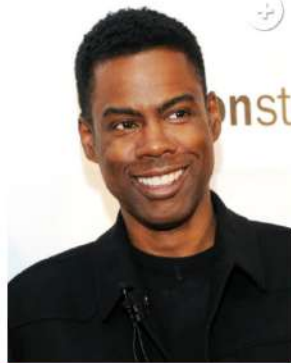
Chris Rock