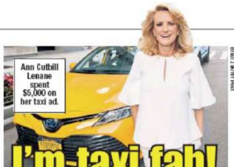
Brian Z. W. / NY Post